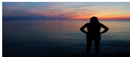
End of Summer